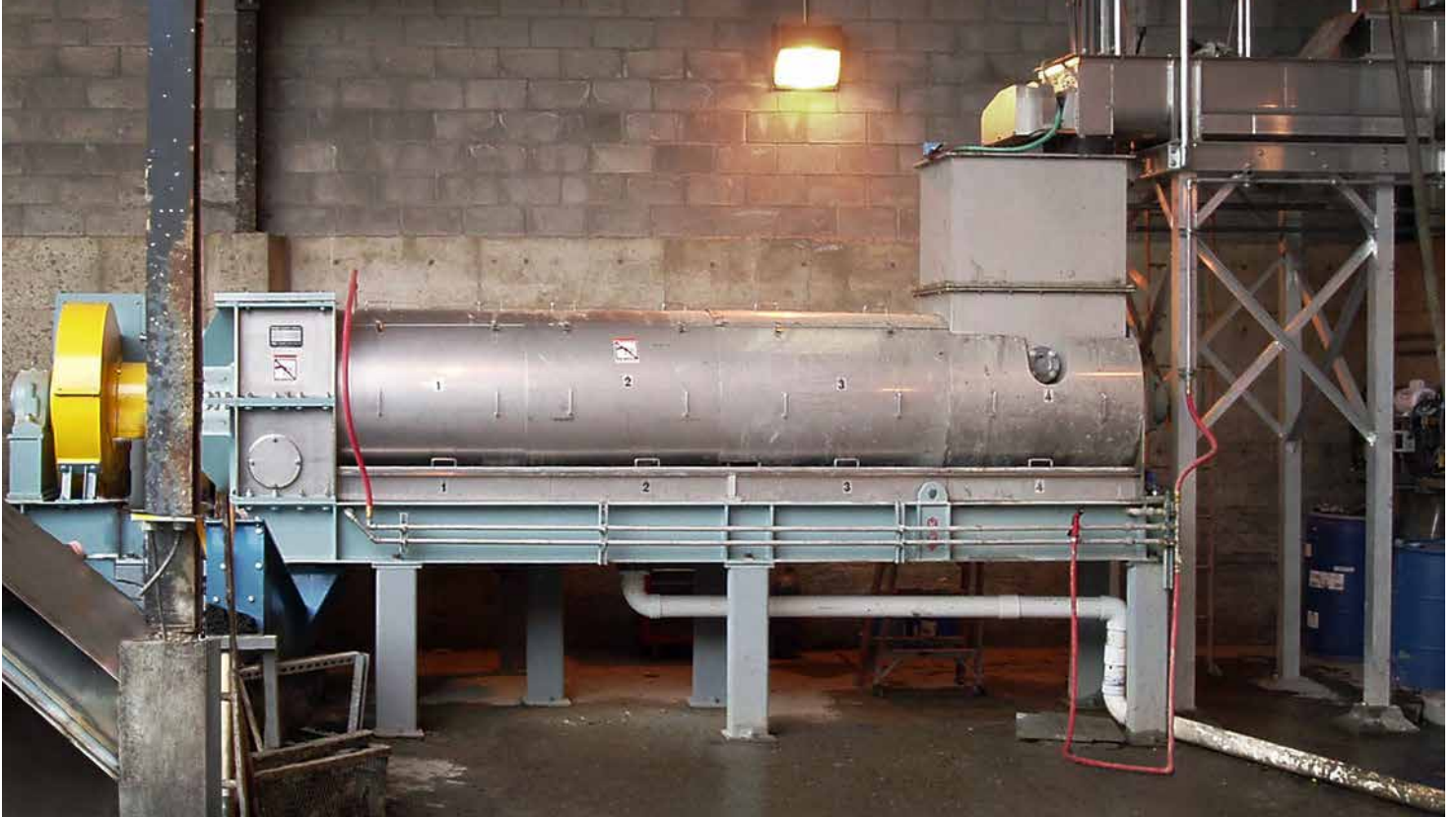
Hydro-vac mud dewatering screw press with a capacity of 1,250 gallons/hour.