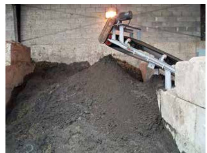
Dewatered Hydro Vac Mud