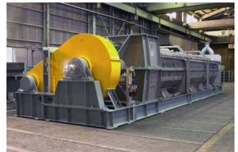
Large Mud Dewatering Screw Press