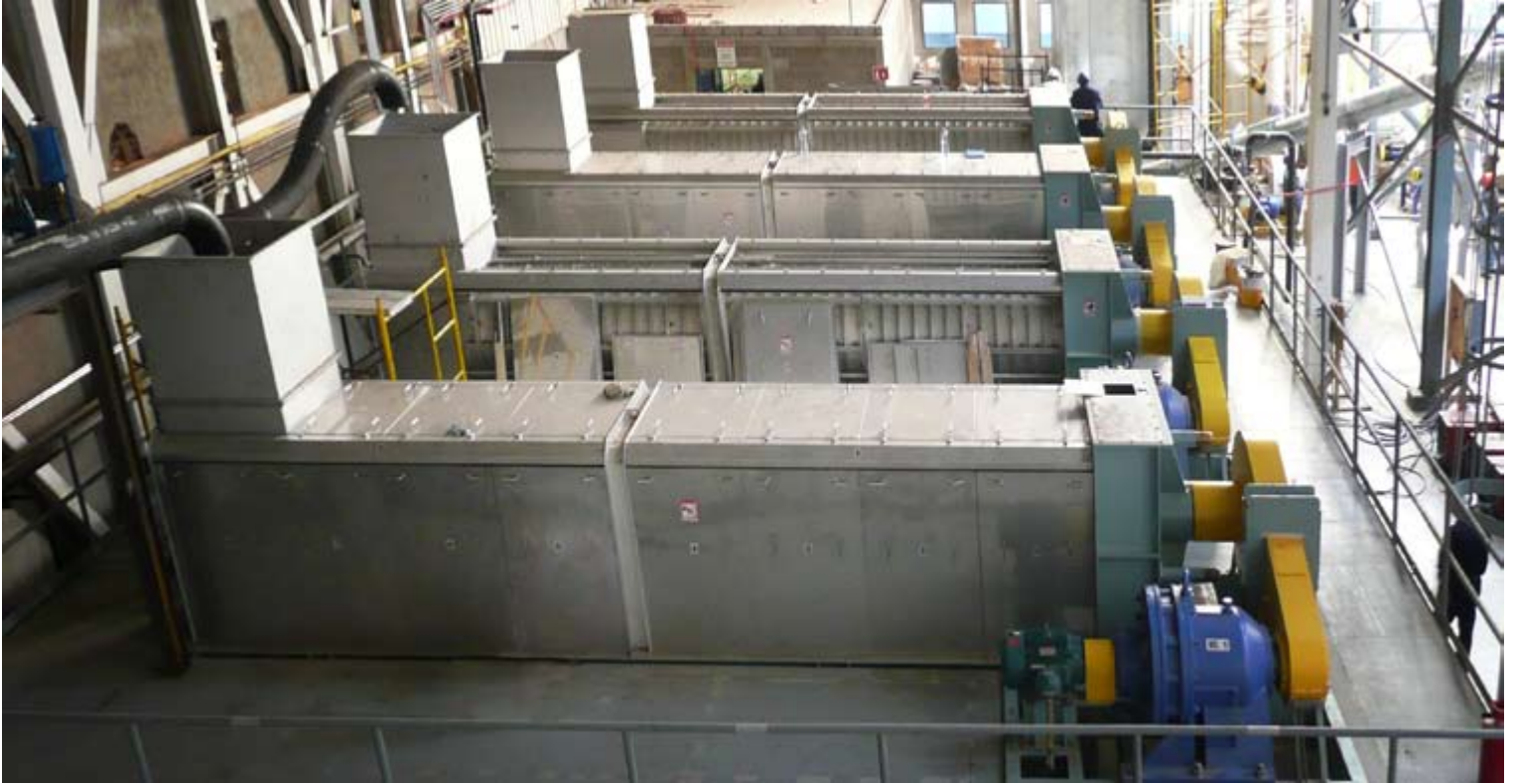
Four HX-1000 model screw presses installed at Grupo Modelo's Zacatecas, Mexico brewery.