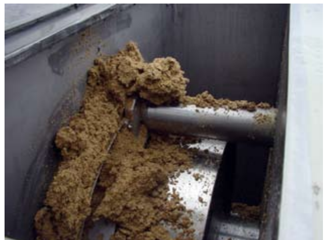
Dewatered brewery spent grain at 60–62% moisture

FKC Co., Ltd. 2708 W. 18th Street Port Angeles, WA 98363 (360) 452-9472 www.fkcscrewpress.com mail@fkcscrewpress.com