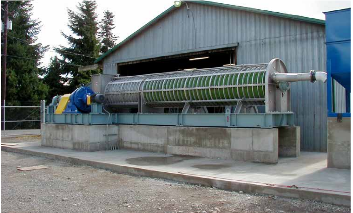
Septage dewatering screw press with a capacity of 6,000 gallons/hour